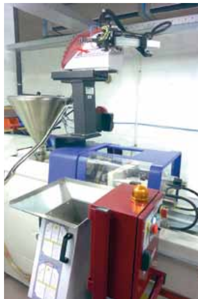
Views of the WITTMANN Minor 2 screenless granulator beside the processing machine at JECOBEL. A W702 sprue picker, also from WITTMANN, is mounted on the machine.