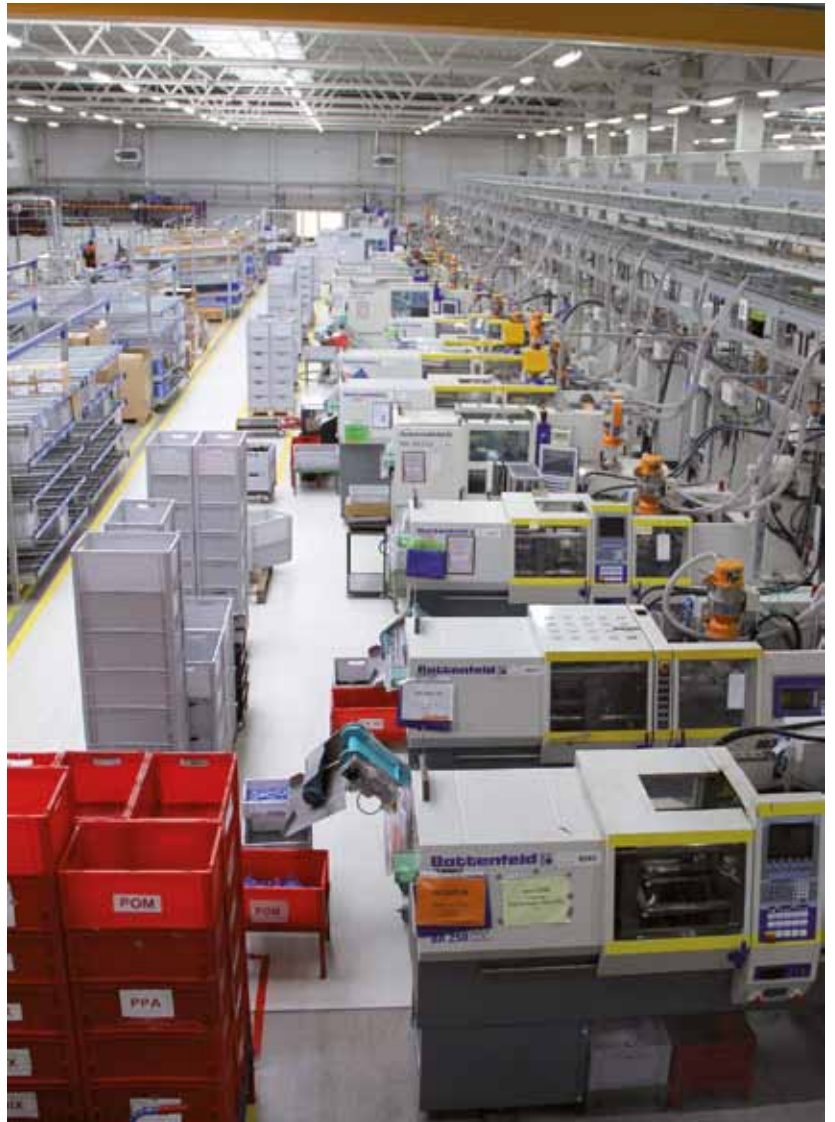
Production floor at REUTTER SK s.r.o in Myjava, Slovakia.

A special strength of REUTTER is their development and production of complete system solutions with their AdBlue® filling systems and tank locking caps for passenger cars, pickups, trucks and vans, as well as agricultural and construction machinery. To meet the stringent requirements from customers in all of these areas and to ensure safety,