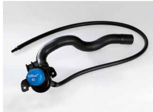
Picture left: AdBlue® cap. Picture right: AdBlue® system with cap and tubing.

for its customers and strengthens its market position by setting benchmarks with its own product development projects.