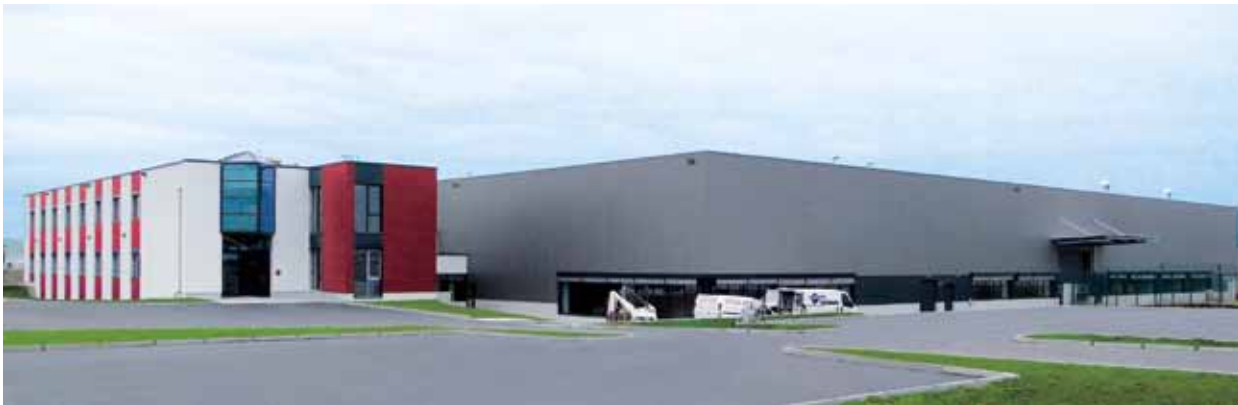
View of the new building in Wolkersdorf near Vienna, now used by the bulk material division.

After a construction period of less than a year, the new building in Wolkersdorf near Vienna has now been completed. The bulk material division, previously located in Vienna, was able to move in by mid-October last year. An ambitious goal has been set for this corporate business segment: its output is to be doubled!