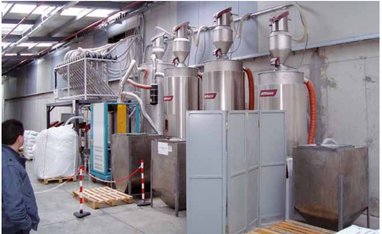
Battery of SILMAX drying Silos with FEED-MAX material loaders as part of the central material drying and conveying system at GOTMAR based in Saedinie in Bulgaria.

G OTMAR, based in Saedinie, Bulgaria, started in 1992 with the production of plastic packaging solutions for sunflower oil, including the bottling and marketing of this product. In 1998, the set-up for the production of PET preforms and bottles started. Subsequently, GOTMAR took over the production of technical parts for several well-known manufacturers of white goods, mainly refrigerator parts for Liebherr Bulgaria, but also, amongst others, for Schneider Electric, Steca, and ABB.