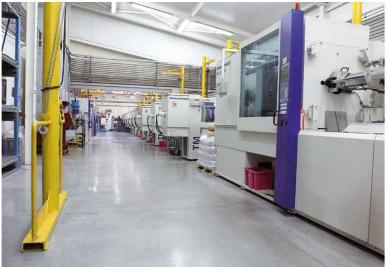
This picture, and picture on the opposite page: LIMAK plant in Czestochowa with the WITTMANN BATTENFELD machines in operation.

I n baby carriage production, there are a large number of companies that are exclusively engaged in assembly. By comparison, the number of suppliers making the parts required for their end products themselves – or even manufacturing just these parts without assembling them – is relatively small. The Polish plastics processor LIMAK, founded in 1984, ranks among the largest manufacturers of individual components used in baby carriage production.