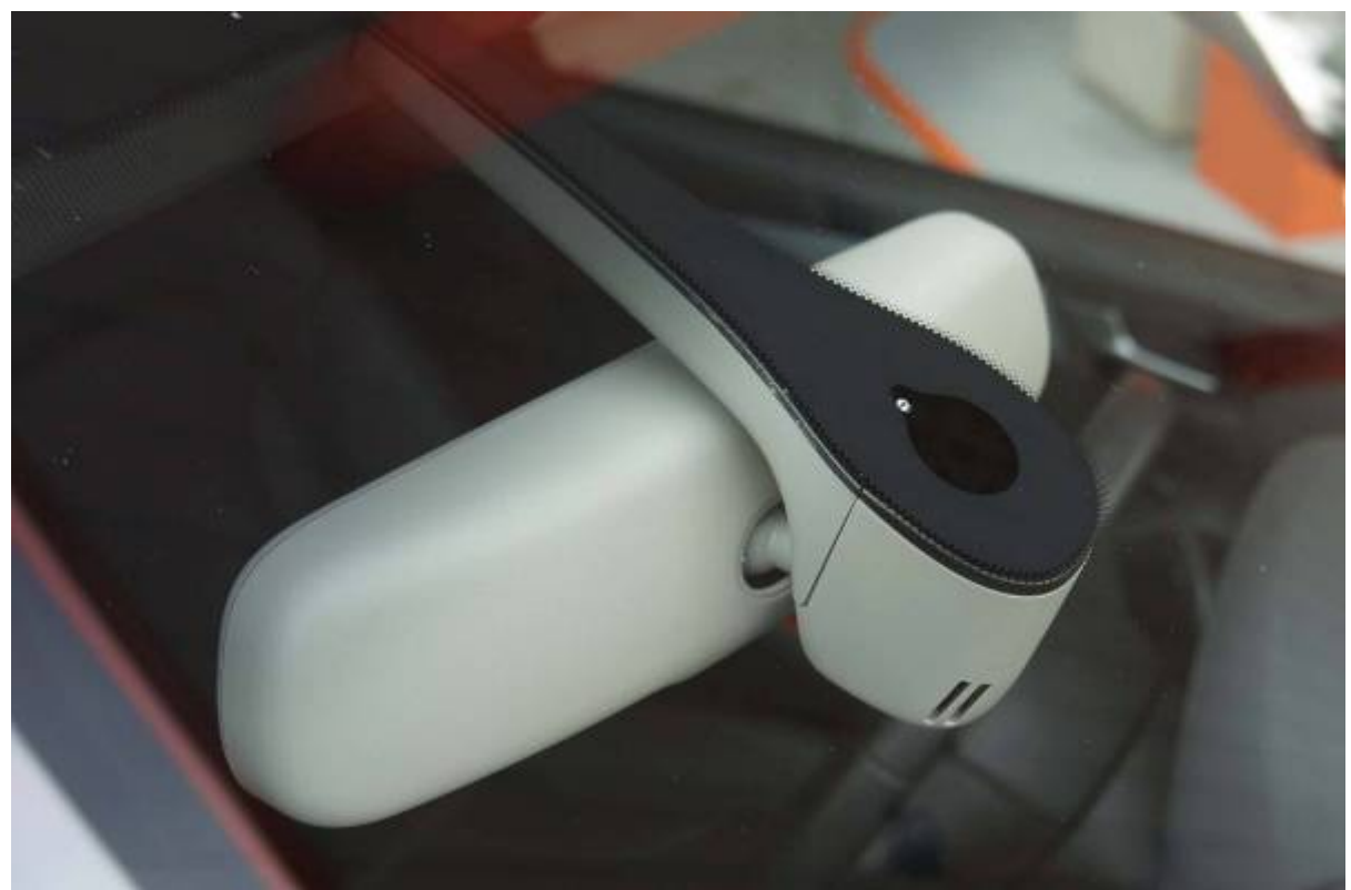
Fig.1: Installation example of a combination sensor for headlight and windshield wiper control integrated in the rear view mirror bracket on the windshield of a car.