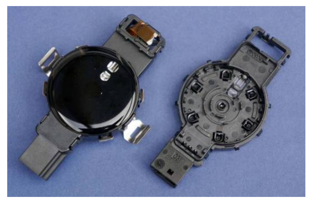
Fig.2a+b: The rain/light/moisture sensor is a 4-component part: two lenses made of crystal-clear PC, plus seven lenses made of purple PC, and the housing consisting of black PC. Three metal contact pins, which are placed into the mold and then insertion-molded, are the fourth component.