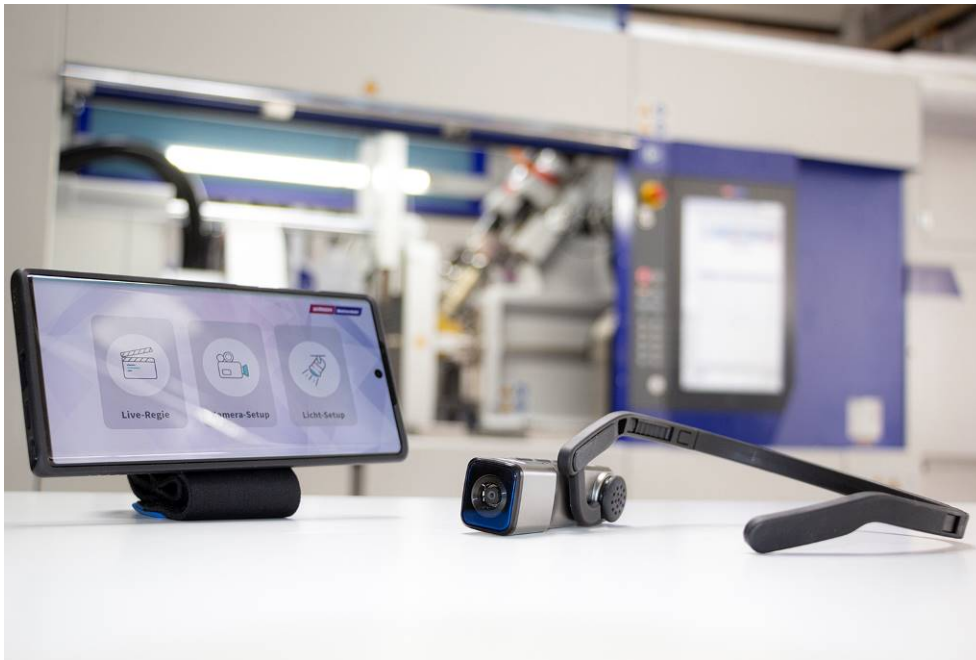
Fig. 1: Head camera with app for control via Smartphone